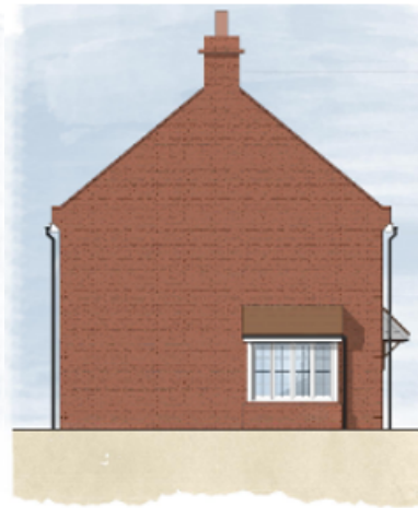
SIDE ELEVATION A