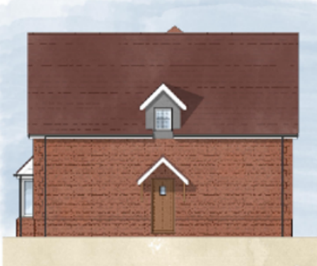
SIDE ELEVATION B