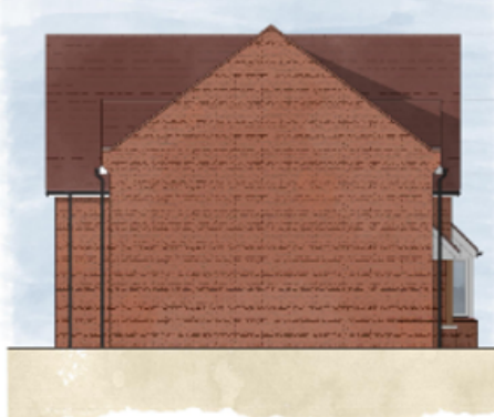
SIDE ELEVATION A