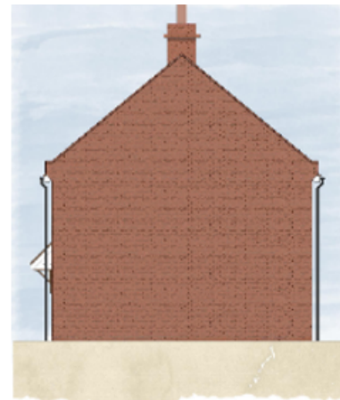
SIDE ELEVATION B